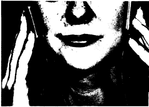
Fig. 1. External sponge pad electrodes placed bilaterally over subject's zygomatic arches.

evaluate their pain every 12 hours by marking the spot on the line they believed to best represent the pain they were experiencing at the time. The VAS score is the distance from the bottom of the line to the point of the subject's mark, measured to the nearest millimeter. Subjects were also instructed to make each evaluation independently from the previous ones by not consulting the previous VAS ratings. Subjects in both the 2- and 3-day treatment groups returned 24 hours later to repeat the treatment procedure. Subjects in the 3-day treatment group returned for an additional treatment 24 hours later. The subjects in the control group received no treatment procedures. Because each repeated factor is nested within the same treatment condition, the presence of absence of any electrical feeling from the TENS unit will not confound the experimental design.