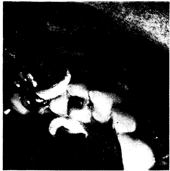
Fig. 2. Internal probe electrodes. One is placed on the crown of each tooth and the other on the palatal mucosa adjacent to the tooth.

The four-way repeated measures analysis of vari-